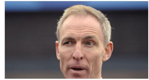
Jim Murphy.